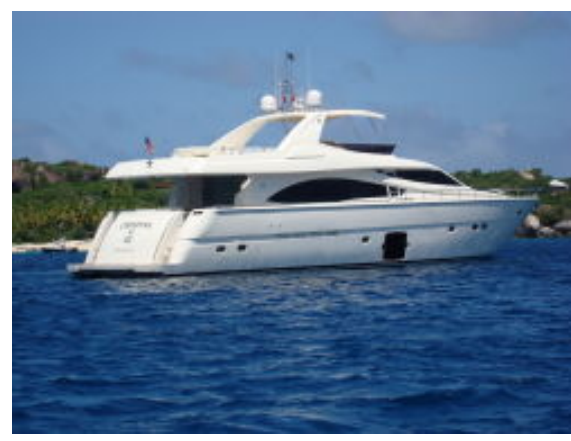
CRISTINA G III

Toll-free 877-256-5923 Tel 239-262-6500 Fax 239-262-6693 Other www.alliedmarine.com Email info@alliedmarine.com