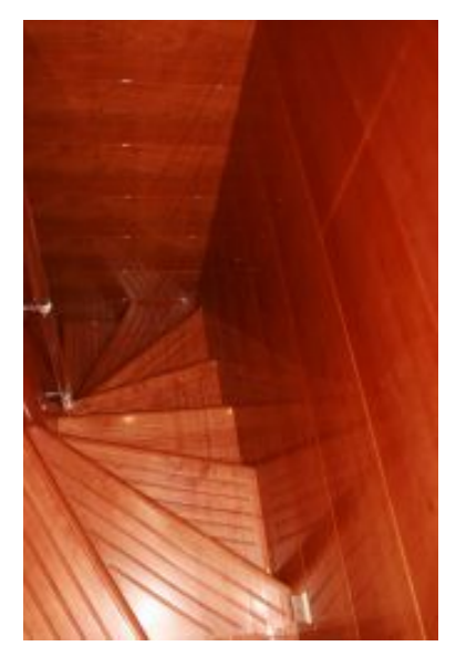
Stairs to Staterooms