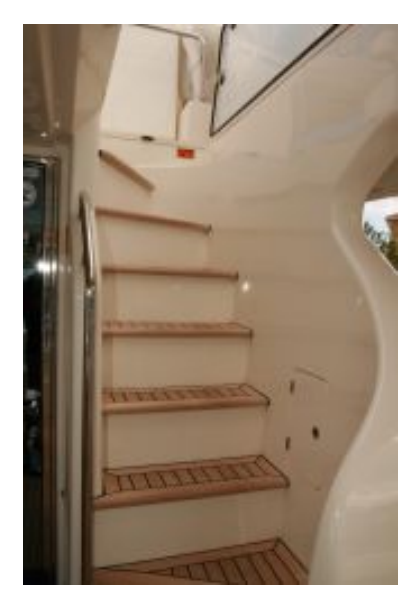
Aft Stairs to Flybridge