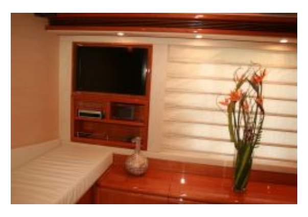
Master Stateroom Entertainment