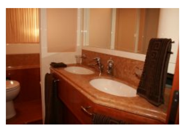
Master Head 2