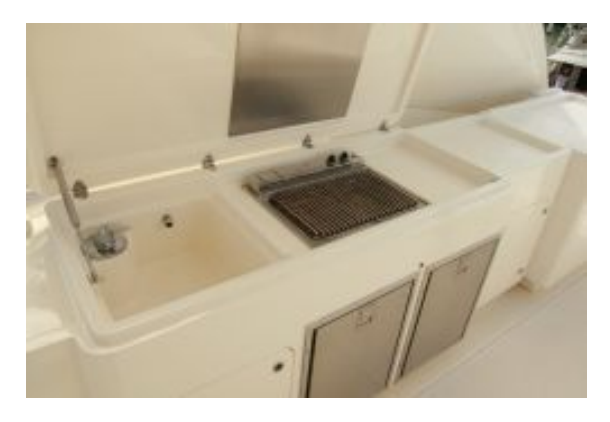
Flybridge Barbeque and Sink