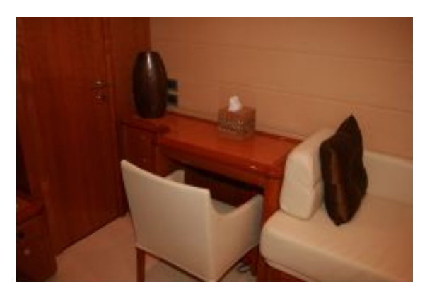
Master Stateroom Vanity