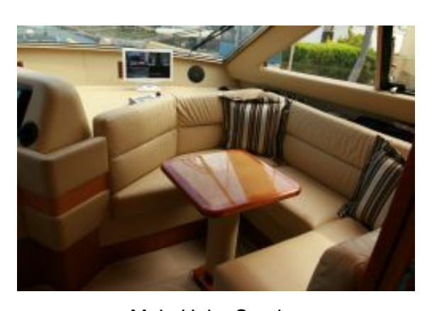
Main Helm Seating