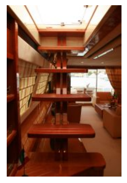
Interior Stairs to Flybridge