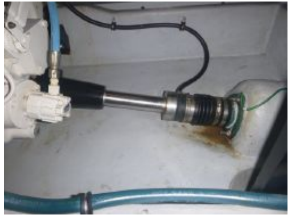
> Starboard Drive shaft