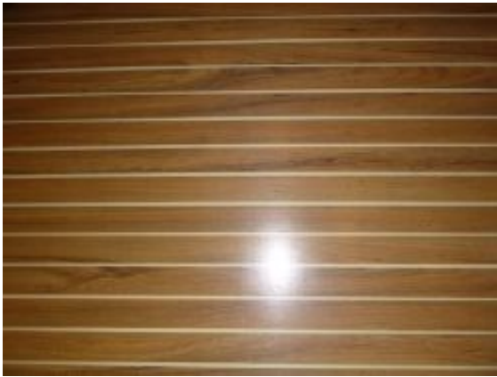
> Teak & Holly Galley Sole