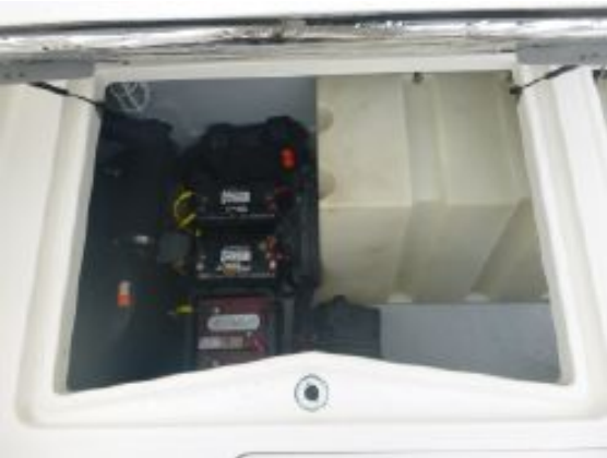
> Batteries In lazarette