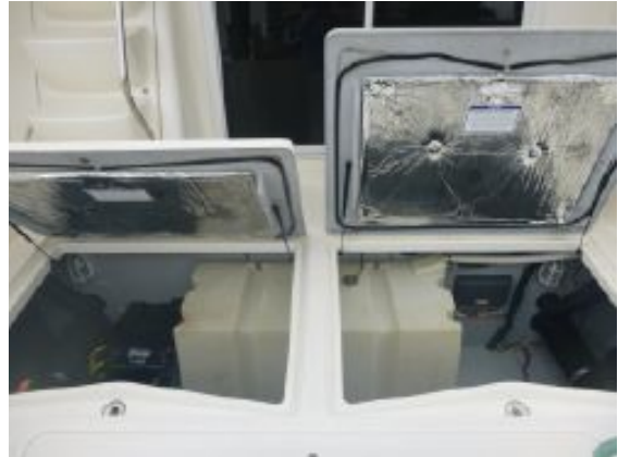
> Cockpit lazarette Access