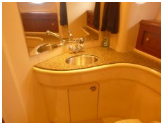
> Guest Head