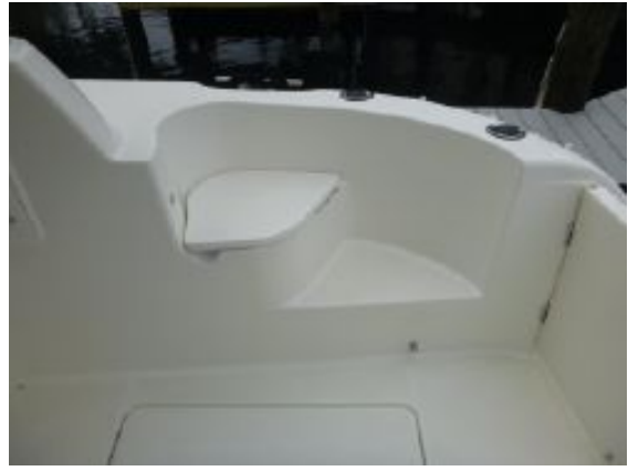
> Starboard Molded Cockpit Step