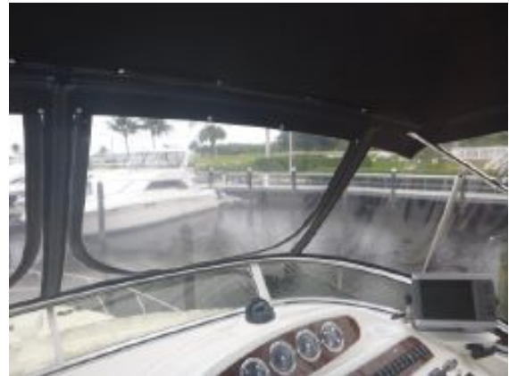
> Clear Bridge Encloser