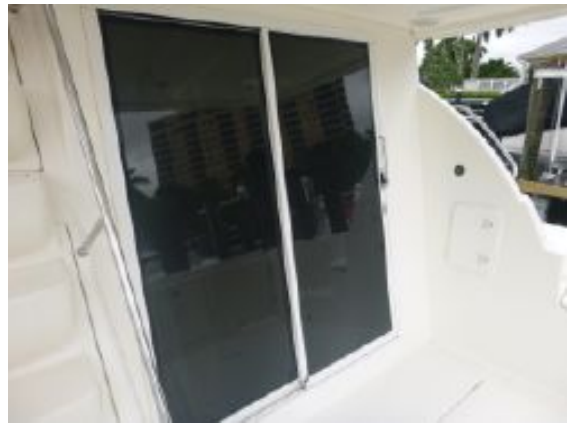
> Sliding Salon Doors