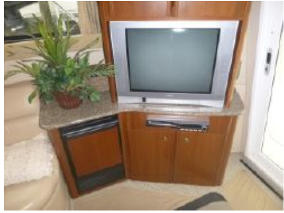
> Salon TV & Ice Maker