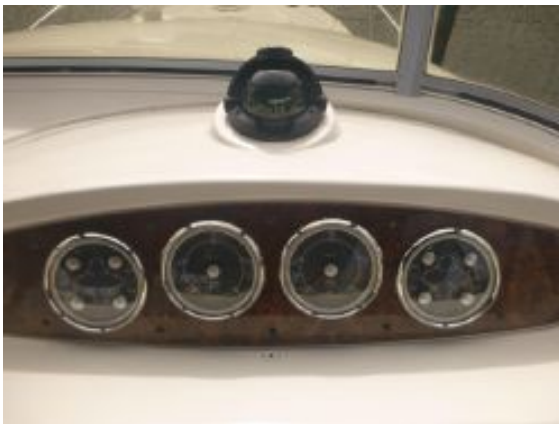
> Clear Helm Gauges