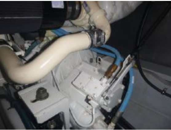
> Starboard 450 HP Cummins