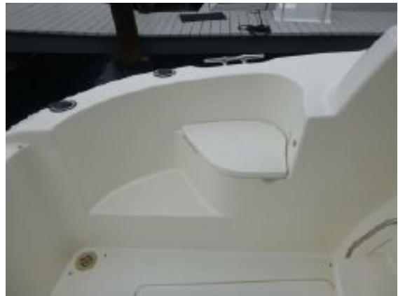
> Port Molded Cockpit Step