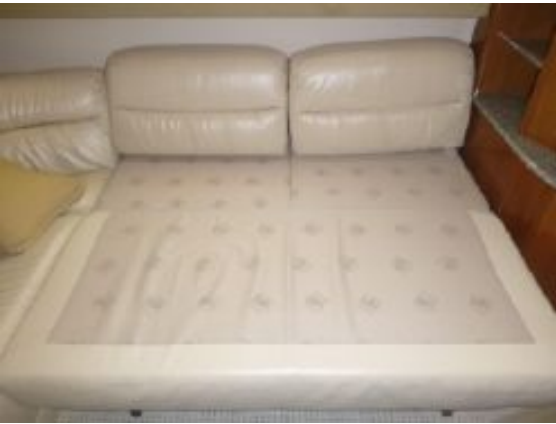
> Sofa / Bed