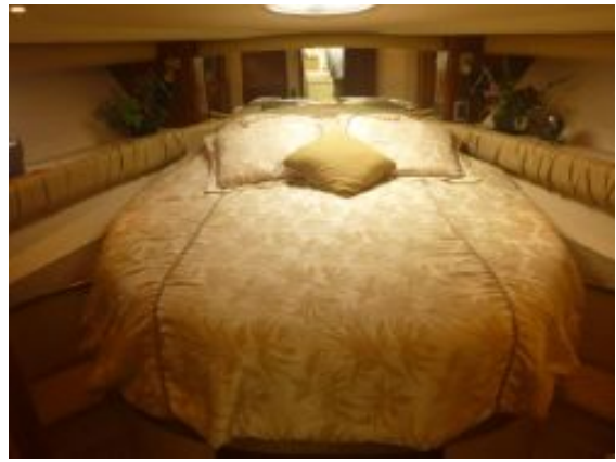
> Owners Bed