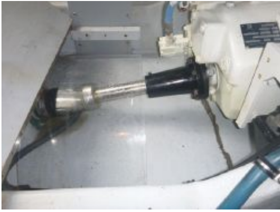
> Port Drive Shaft