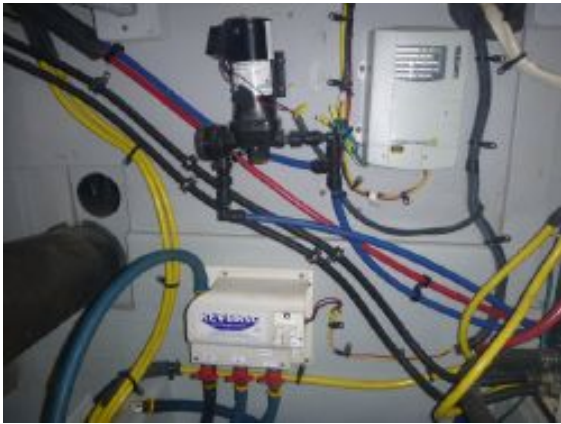
> Oil Change & Battery Charger