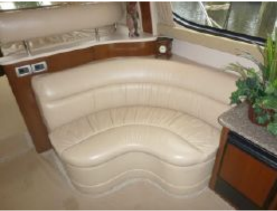
> Salon Seat With Storage