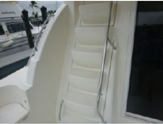
> Molded Bridge Steps