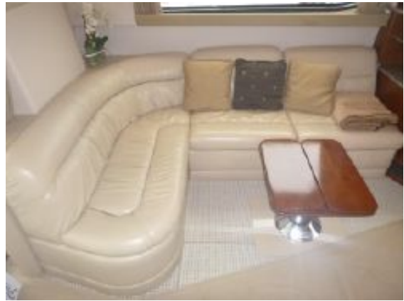
> L-Sape Sofa