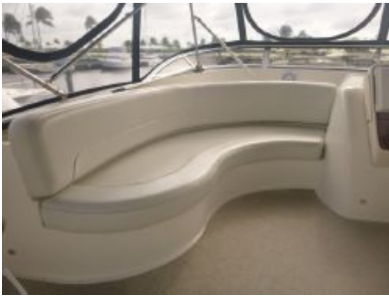
> Bridge Seating