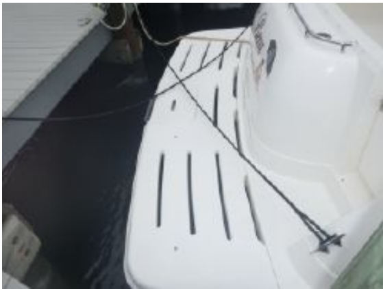
> Swim Platform