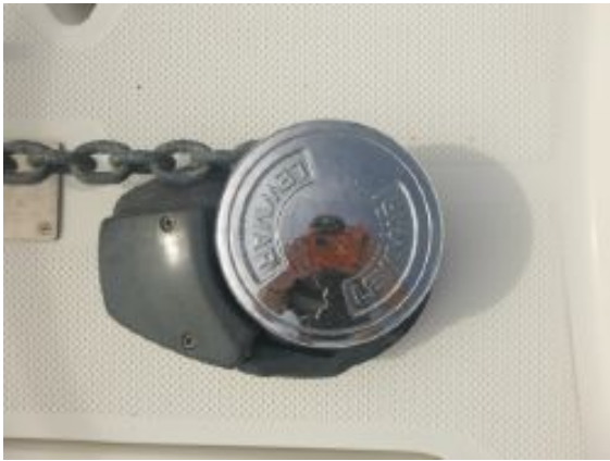
> Lewmar Windlass