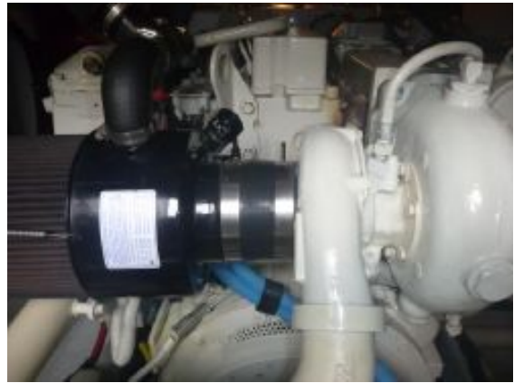
> Port 450 HP Cummins