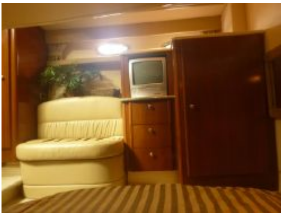
> Side Stateroom