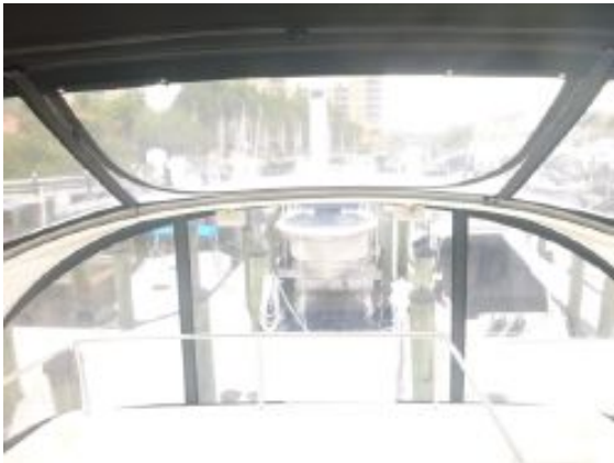
> Clear Bridge Encloser