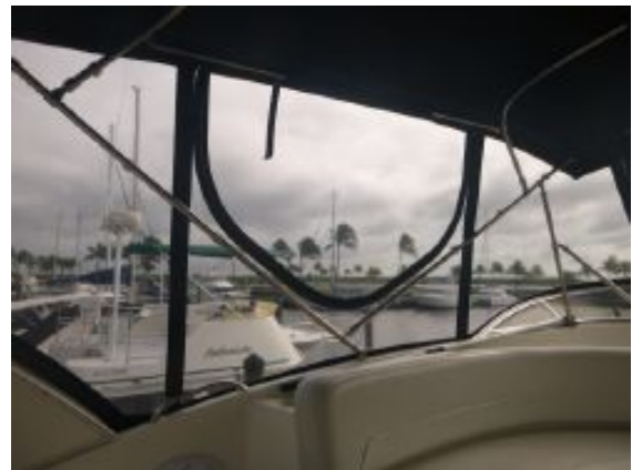
> Clear Bridge Encloser