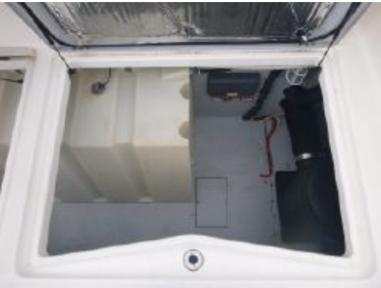
> Stbe Side lazarette