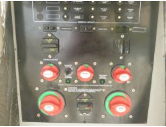
> Battery Switches