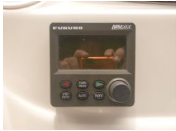
> Auto Pilot