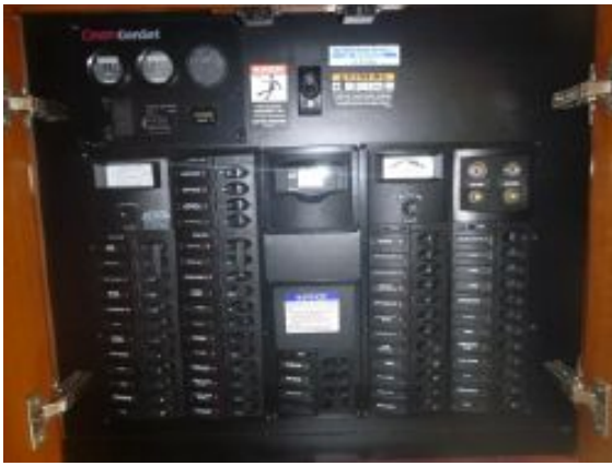
> Salon Electrical Panel