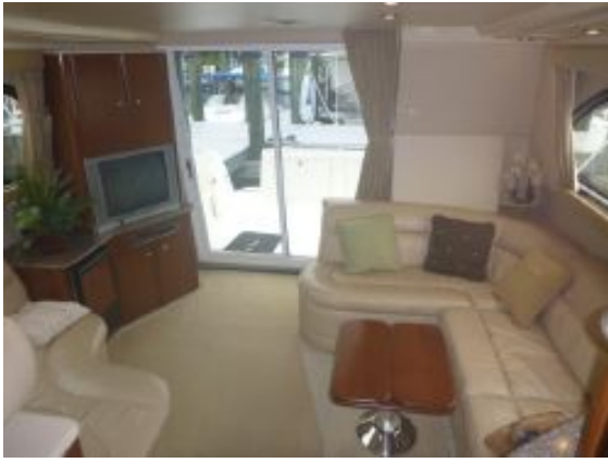
> Salon Aft