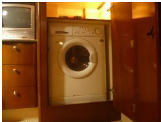
> Washer / Dryer