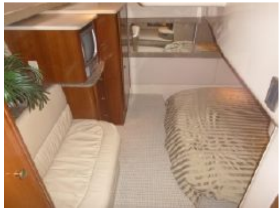
> Side Stateroom