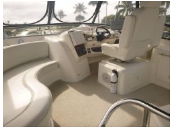
> Bridge Seating