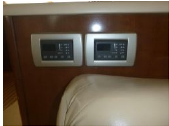
> Salon AC