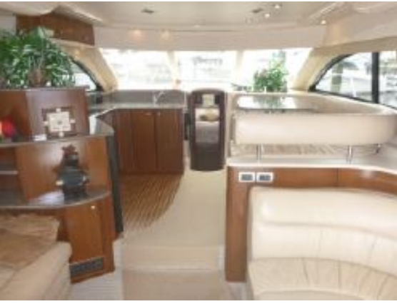
> Salon Forward