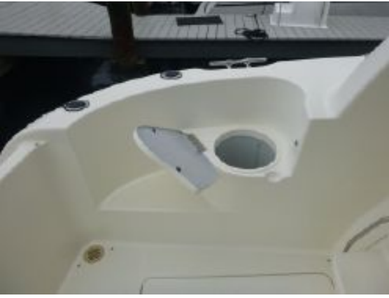
> Port Cockpit Fender Holder