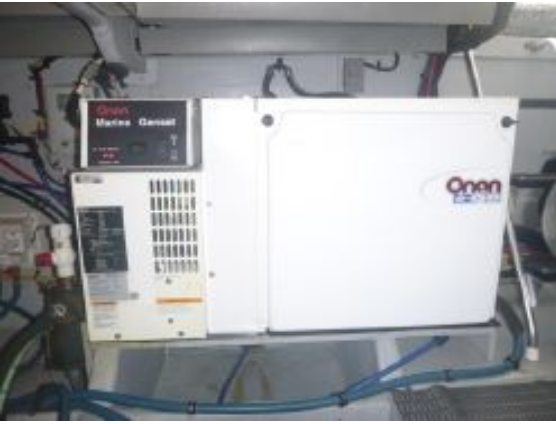
> 11.5KW Onan Generator