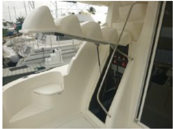
> Cockpit Engine Room Access