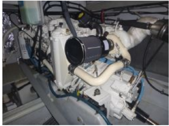
> Starboard 450 HP Cummins