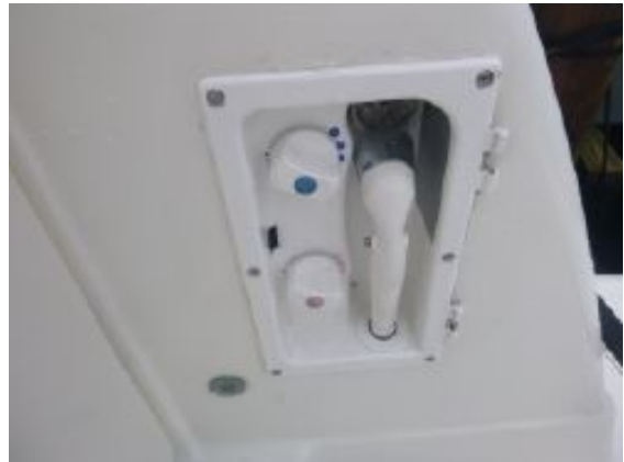
> Transom Shower