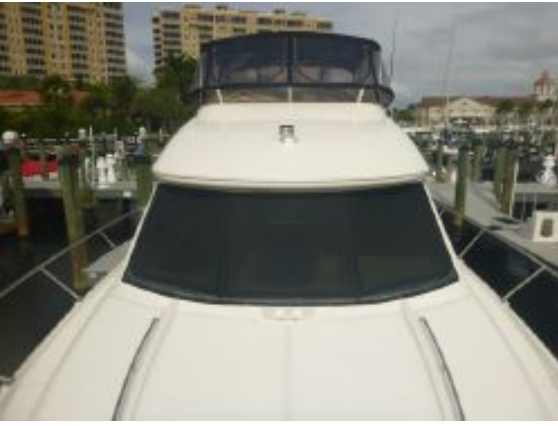
> Windshield & Cover