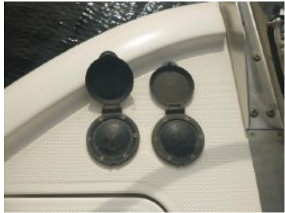
> Windlass Foot Controls