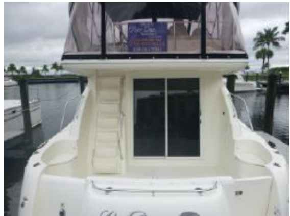
> Aft View