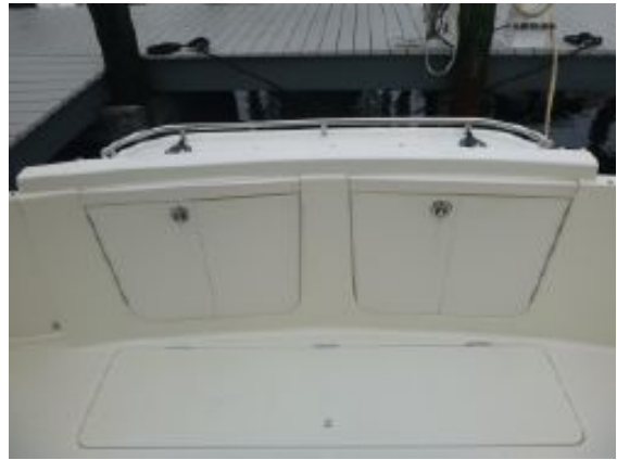
> Aft Cockpit Storage