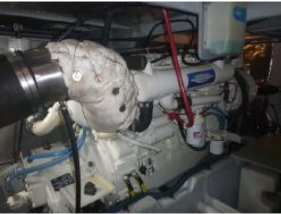
> Port 450 HP Cummins