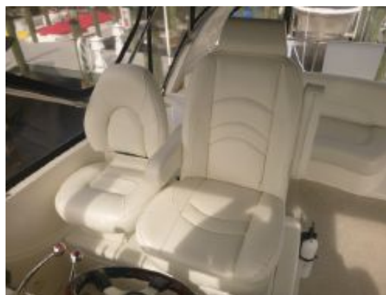
> Upgraded Helm Seats