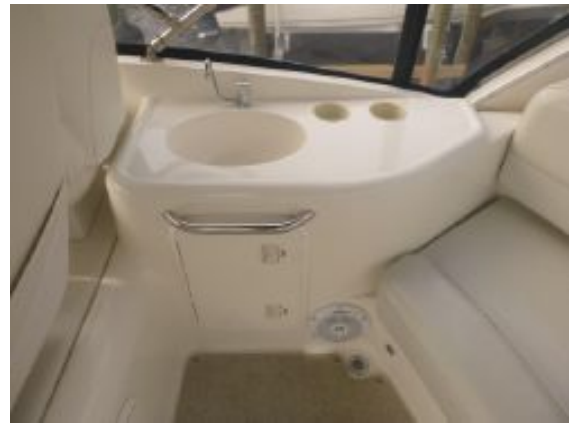
> Bridge Wetbar