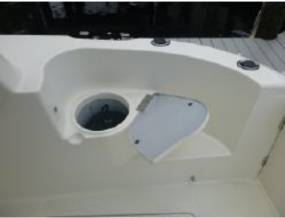
> Starboard Molded Fender Holder