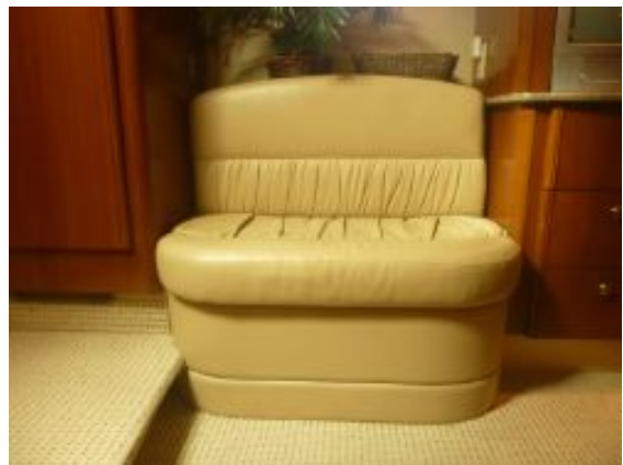
> Side Stateroom Seat