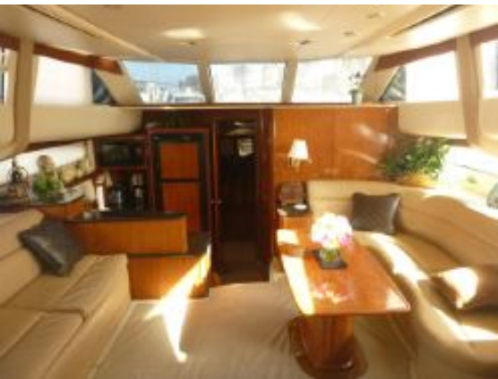
> Salon Forward