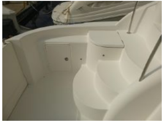
> Molded Boarding Step