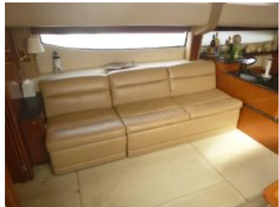
> Salon Sofa Port Side