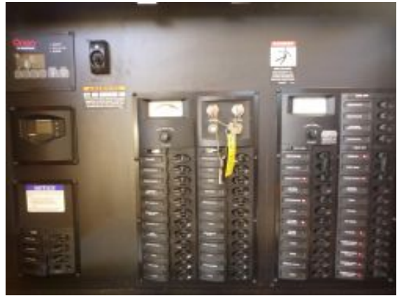
> Electrical Panel