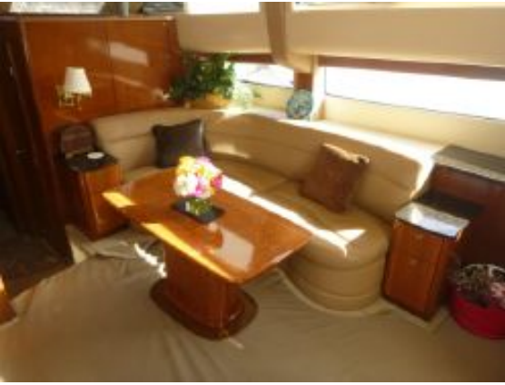
> Salon Sofa And Table Starboard Side