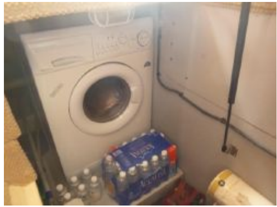
> Washer Combo