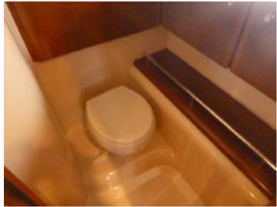
> Owners Bathroom