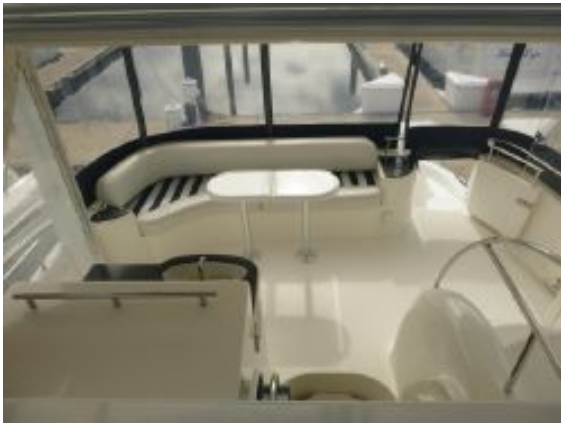
> Lower Cockpit