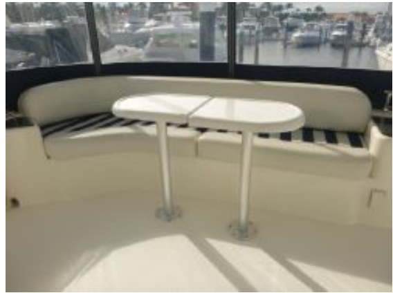
> Lower Cockpit Table And Seat