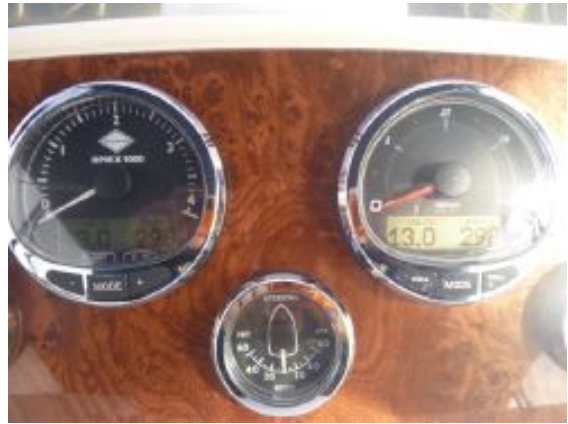
> Clear Gauges