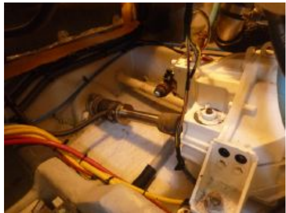
> Drive Shaft