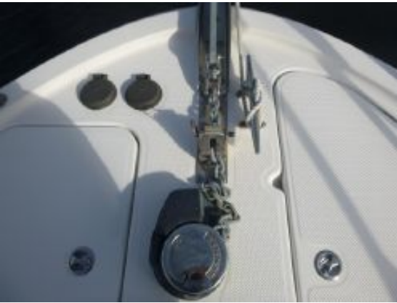
> Lewmar Windlass