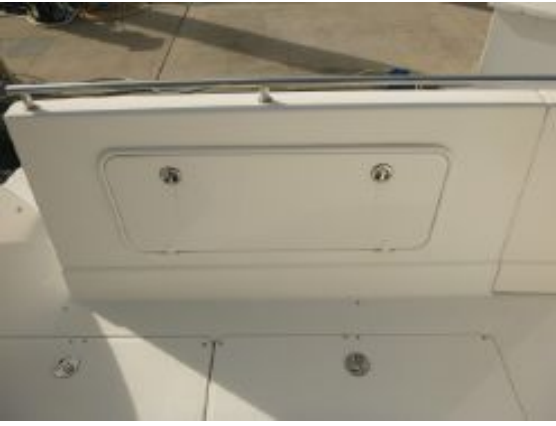
> Transom Storage And Washdown