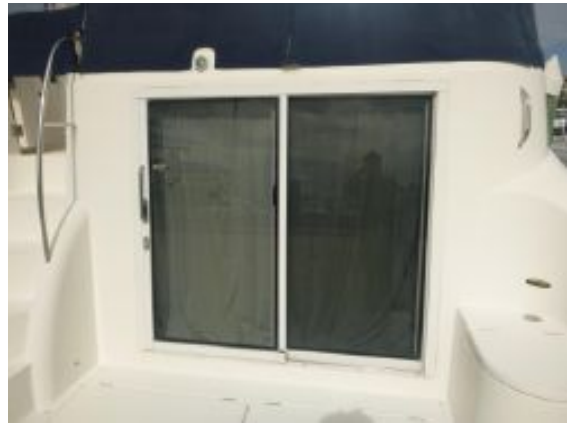
> Sliding Cockpit Stateroom Door