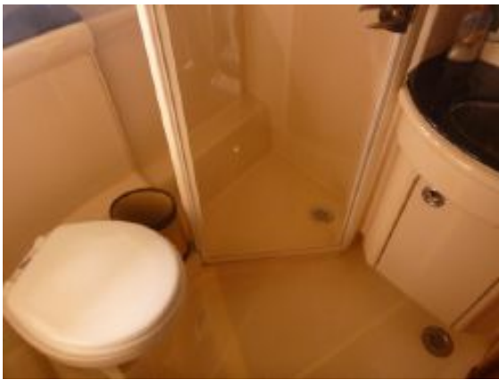
> Guest Bathroom