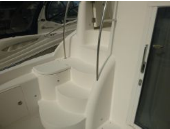
> Molded Bridge Steps