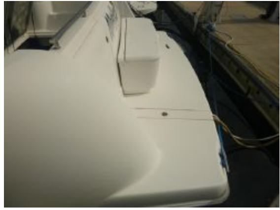
> Transom Trunk