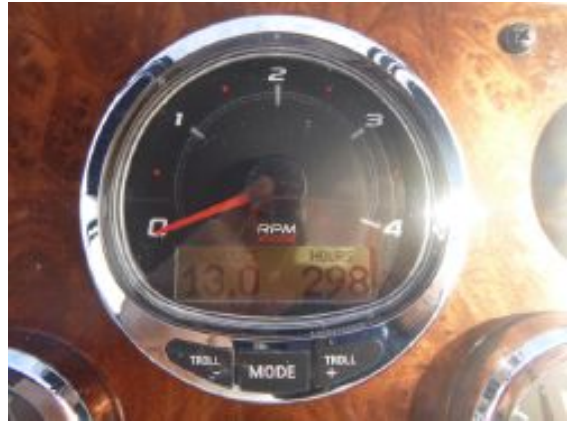
> Hour Meter