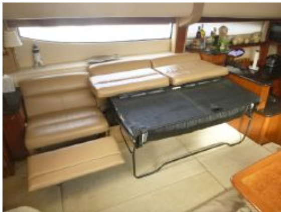
> Salon Lazy Boy & Sleeper