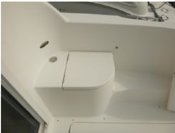
> Molded Boarding Step