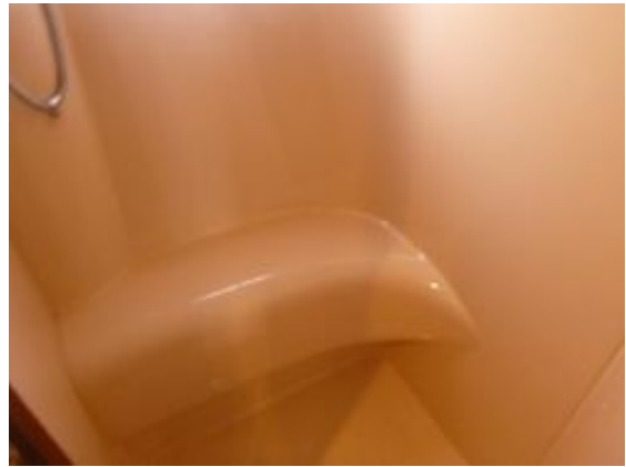
> Owners Shower