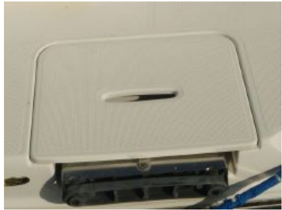
> Swim Ladder