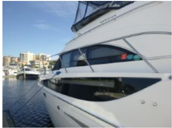
> Hull Side Windows