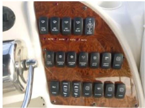
> Clean Rocker Switches