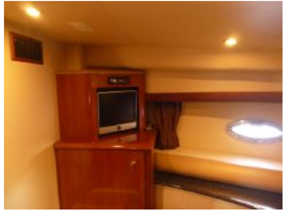
> Guest Stateroom