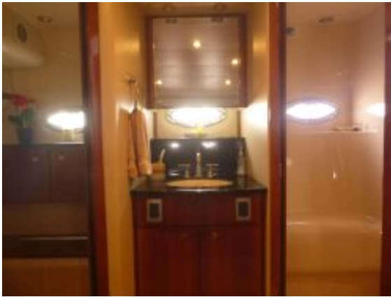
> Owners Vanity And Sink