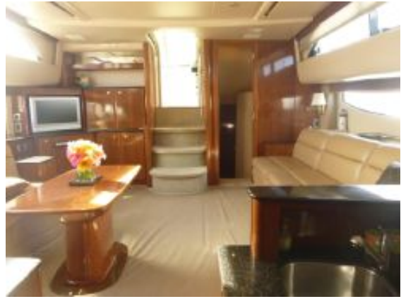
> Salon Aft