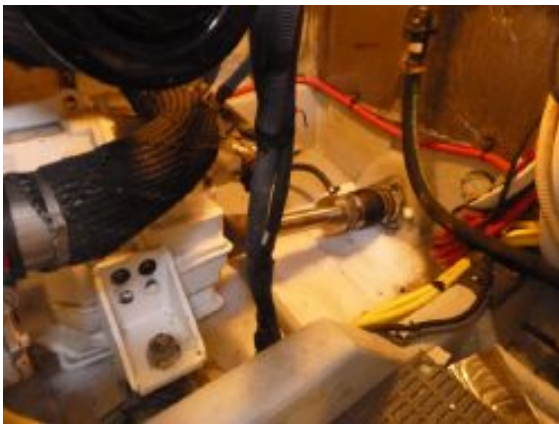
> Drive Shaft