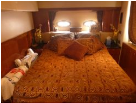
> Owners Berth