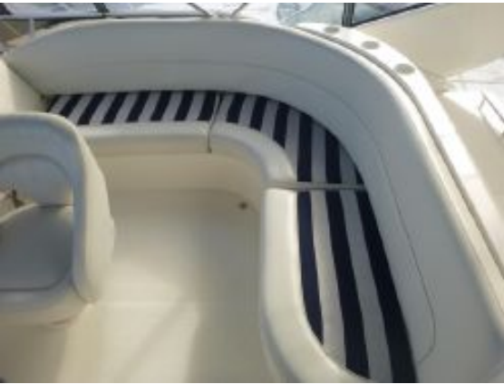
> Upper Deck Seating