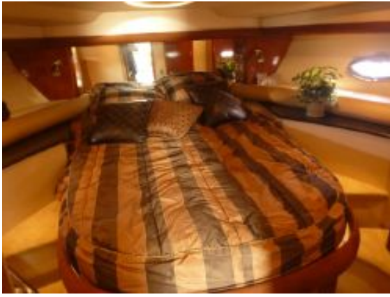
> Guest Stateroom