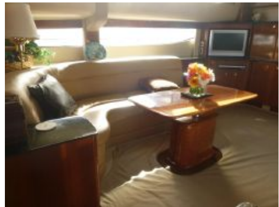
> Salon Sofa And Table Starboard Side