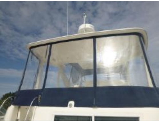
> Aft Enclosure