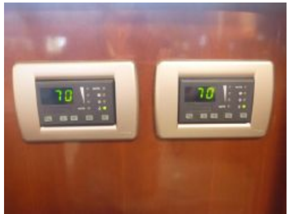
> Salon A/C