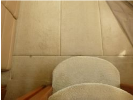
> Salon Carpet