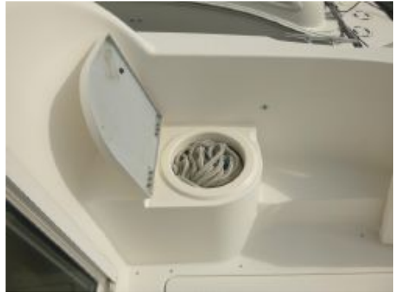
> Molded Boarding Step With Storage