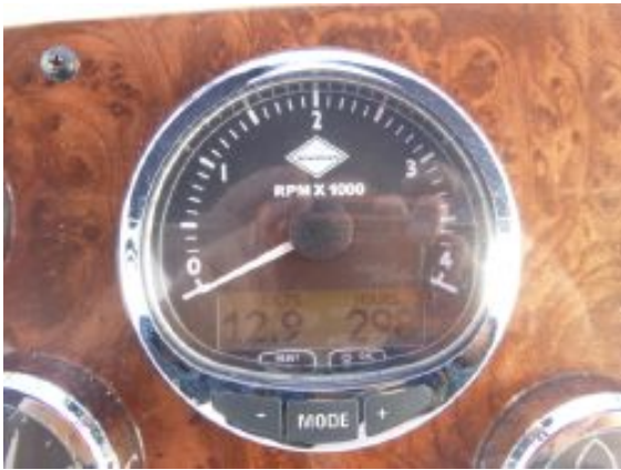
> Hour Meter