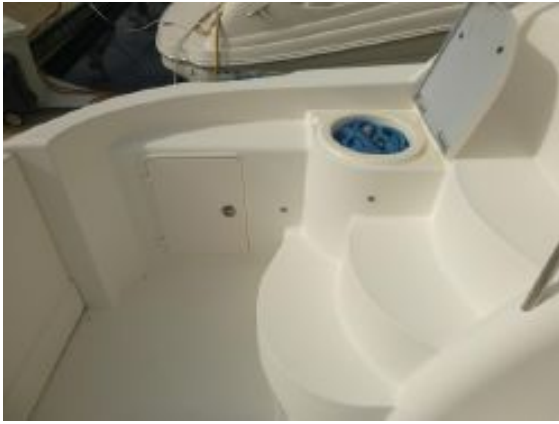
> Molded Boarding Step With Storage