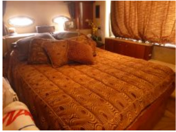
> Owners Berth