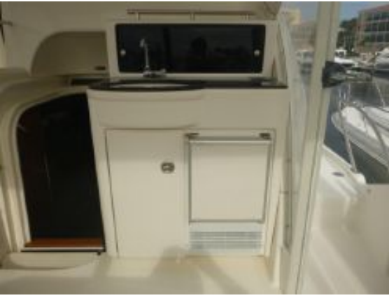
> Lower Cockpit Wet Bar