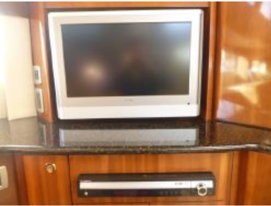
> Salon Entertainment