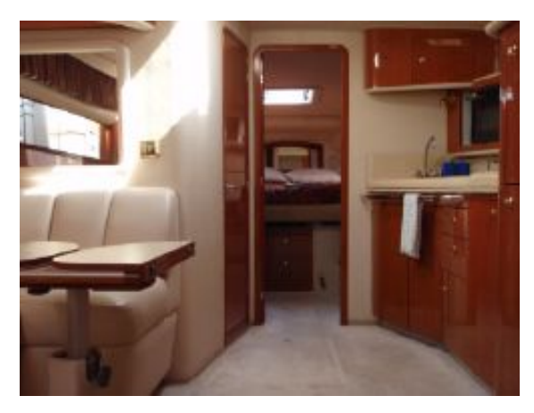
> Salon Forward