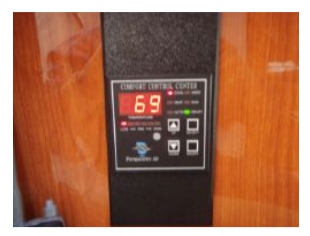
> A/C Panel