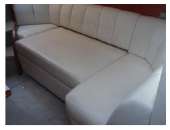
> Sofa out