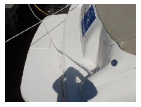
> Swim Platform