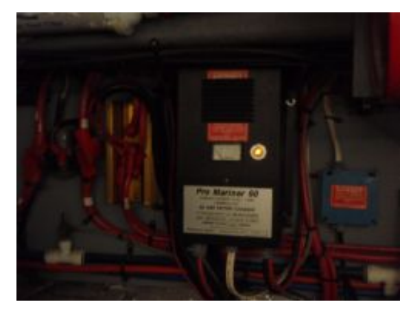
> Battery Charger