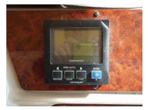
> Simrad Auto Pilot