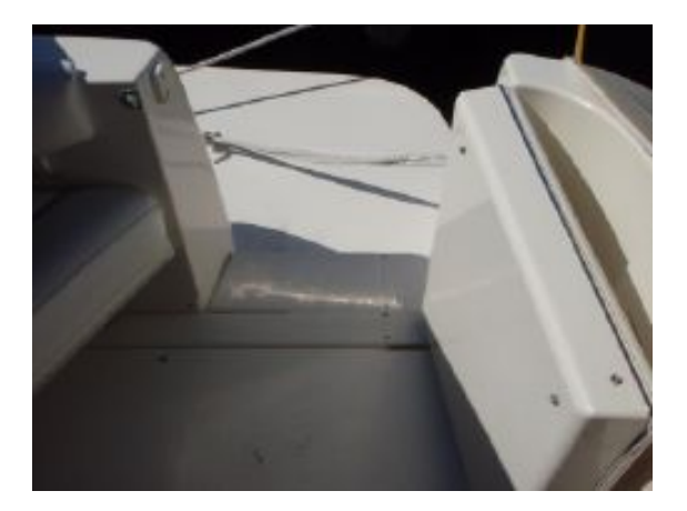
> Transom Gate