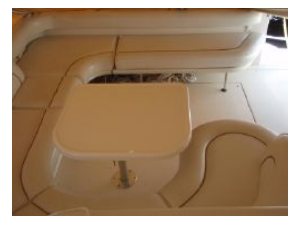
> Cockpit Seating