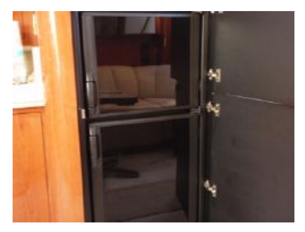
> Fridge Freezer