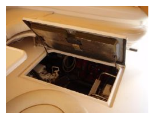
> Engine Access