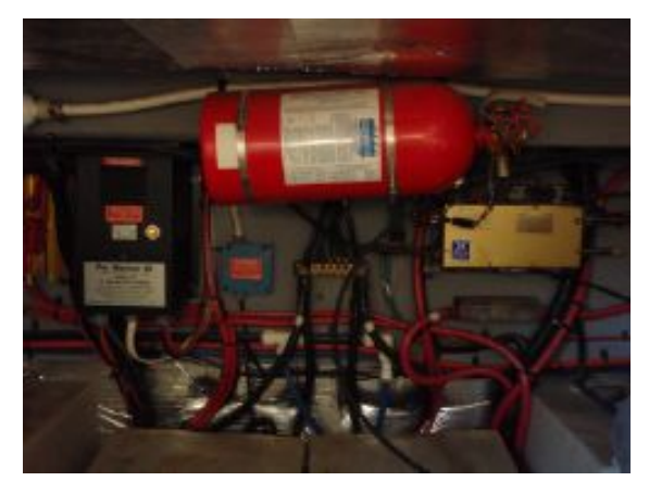
> Fire Supression