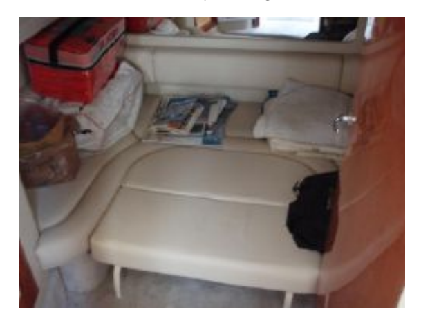
> Mid Cabin