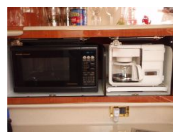
> Convection Oven and Coffee Maker