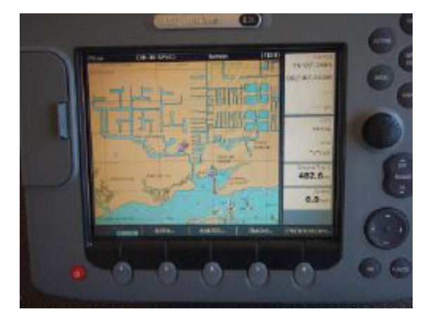
> Ray E80