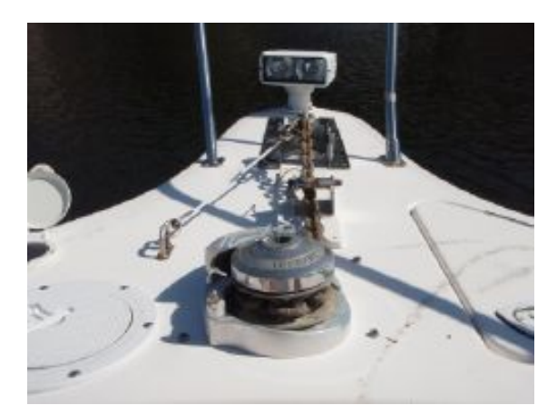
> Lewmar Windlass & Remote Light