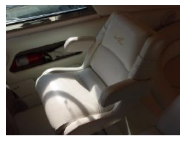
> Capt Seat