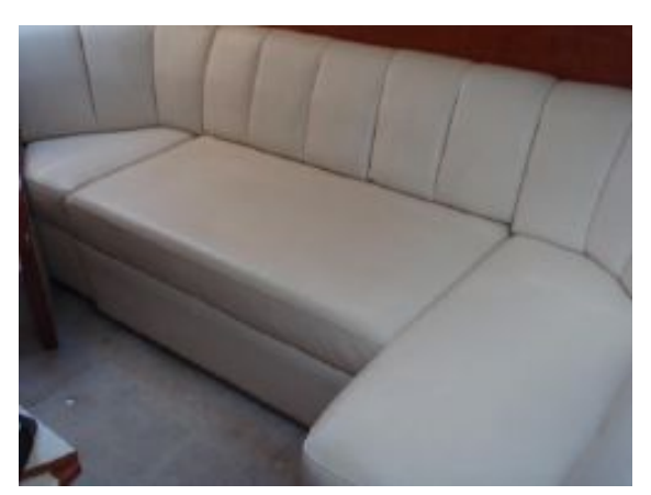
> Sofa In