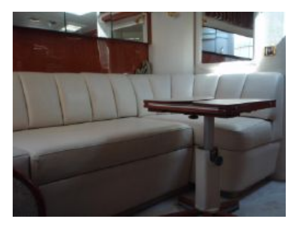
> Salon Table