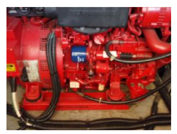
> Westerbeke Generator