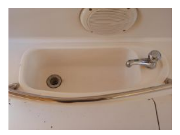
> Cockpit Sink