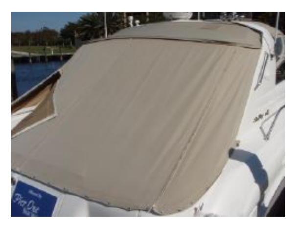
> Aft Canvas