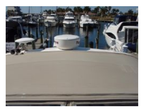
> Canvas Top