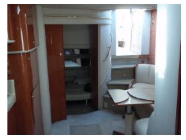
> Salon Aft