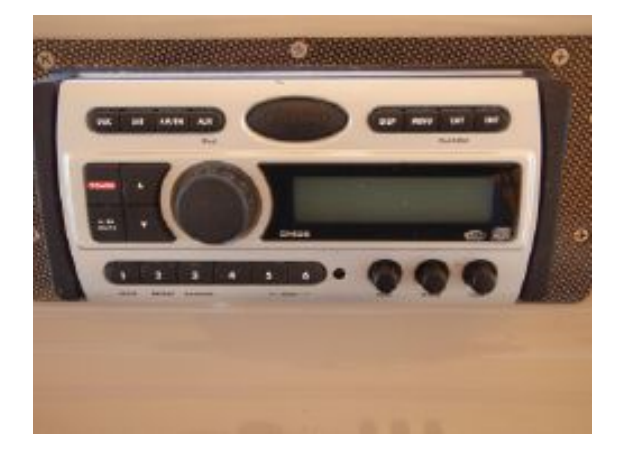
> Clarion CD