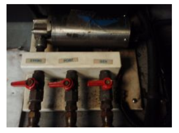
> Oil Change