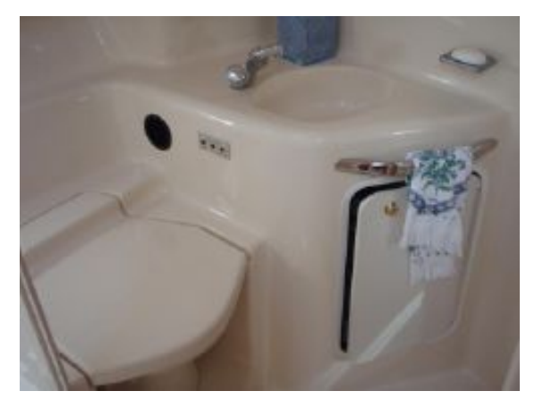
> Owners Head