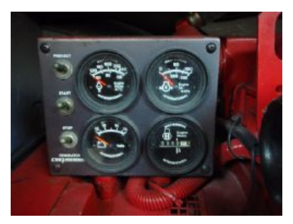
> Gen Gauges