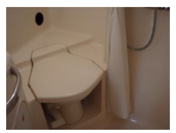
> Guest Head