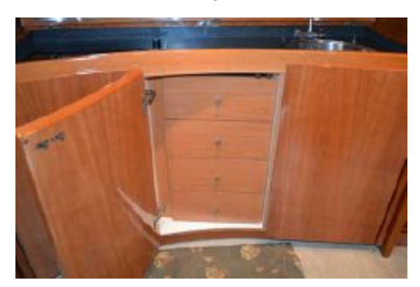
> Galley Storage