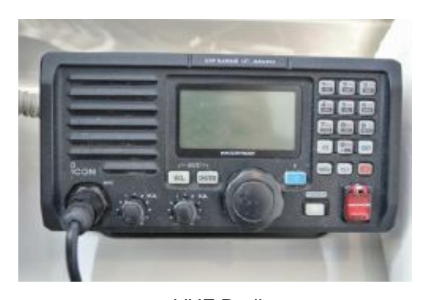
> VHF Radio