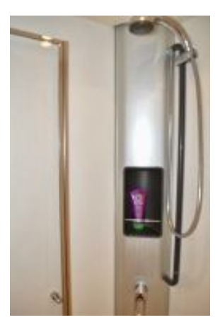
> Master Shower