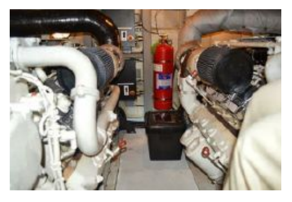
> Engine Room