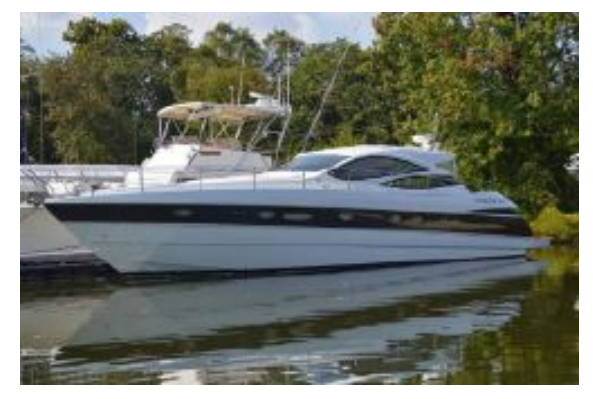
Band of Brothers

Email <u>WAYNE@PIERONEYACHTSALES.COM</u>