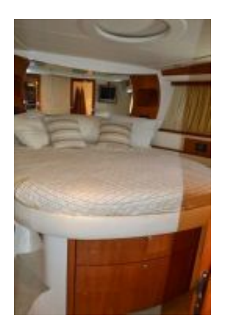
> Master Stateroom