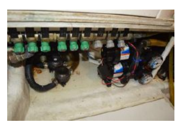
> Engine Room