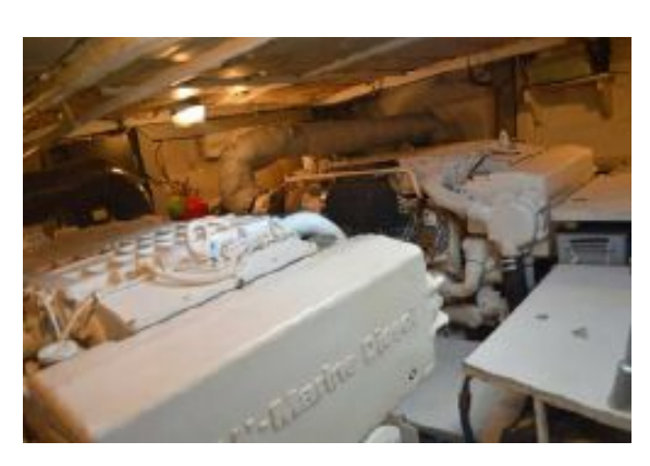
> Engine room