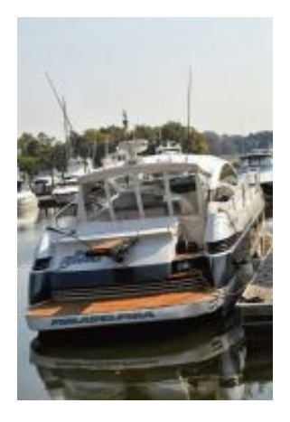
> Aft View