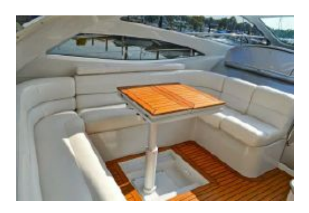
> Folding table