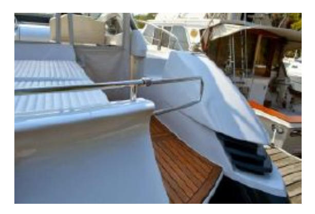
> Aft Steps