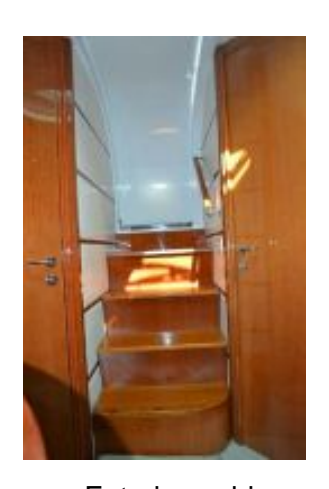
> Entering cabin