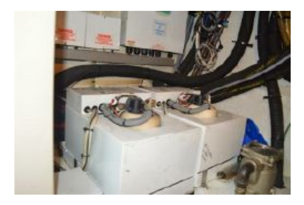
> Engine Room