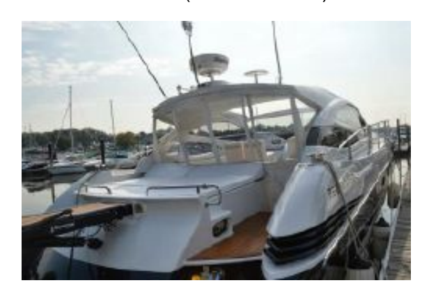
> Aft View