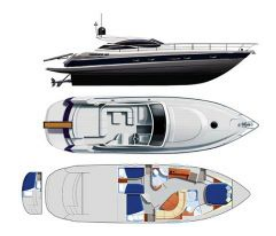
> Manufacturer Provided Image: Layout Plans