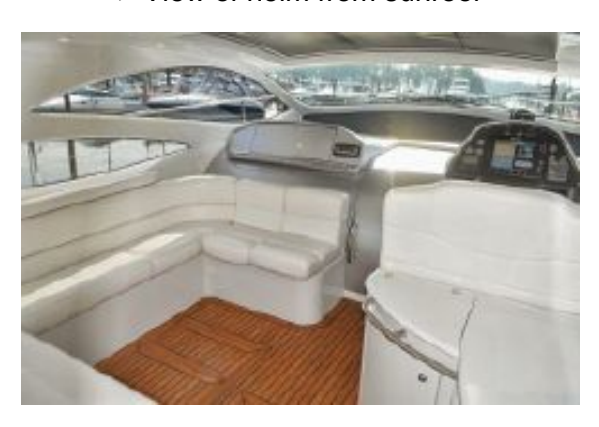
> Helm Seating