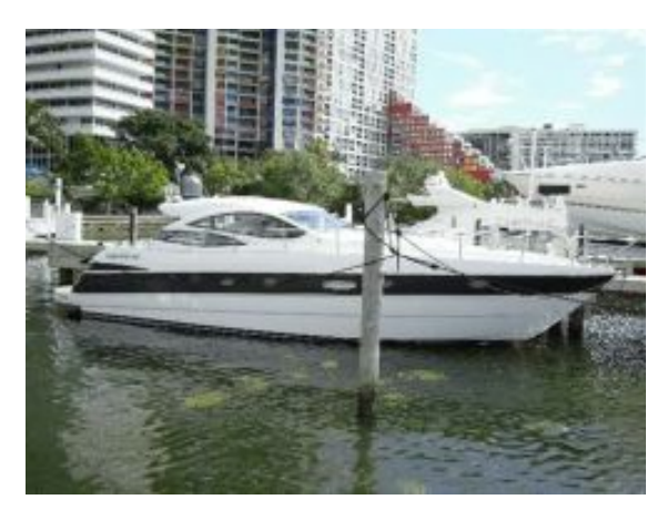
> Profile (Starboard side)