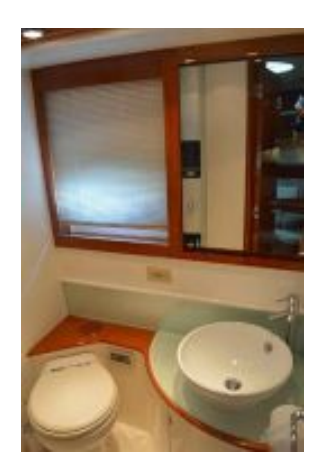
> Guest Head