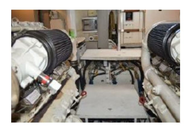
> Engine Room