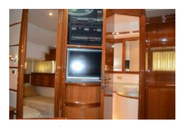
> Salon Entertainment