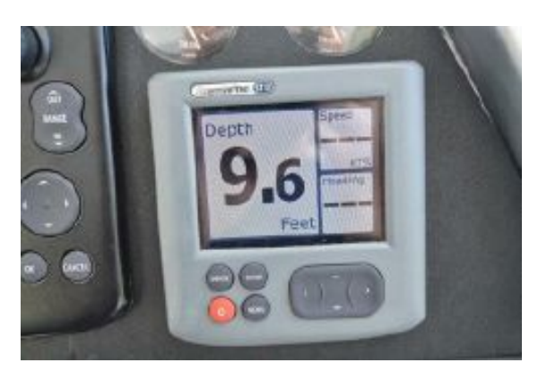
> Depth Sounder