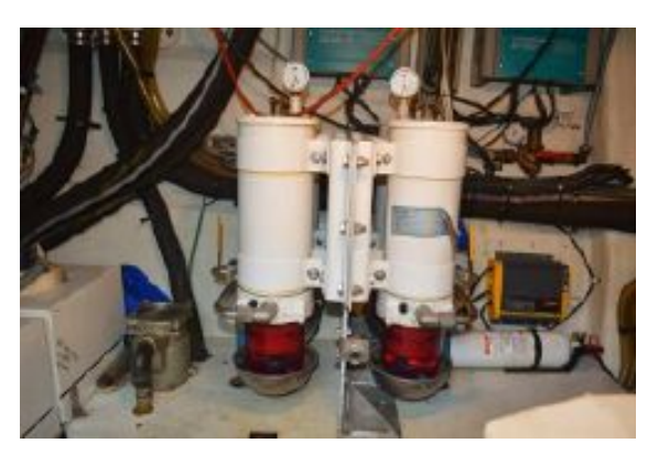
> Engine Room