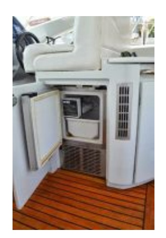
> Ice Maker