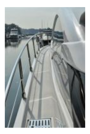
> Port side deck