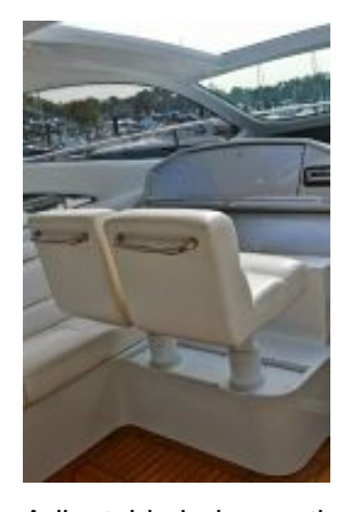
> Adjustable helm seating