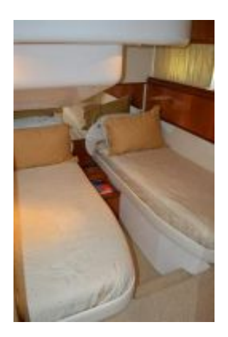
> Guest Stateroom #2