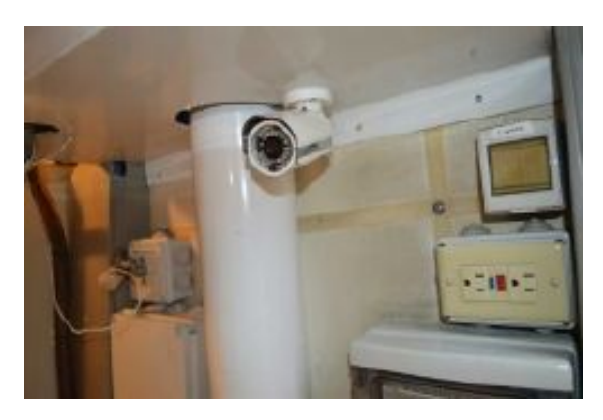
> Engine Room