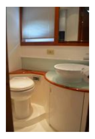
> Guest Head