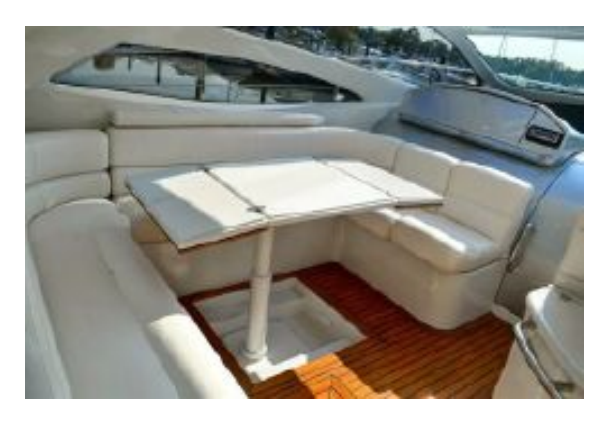
> Folding table