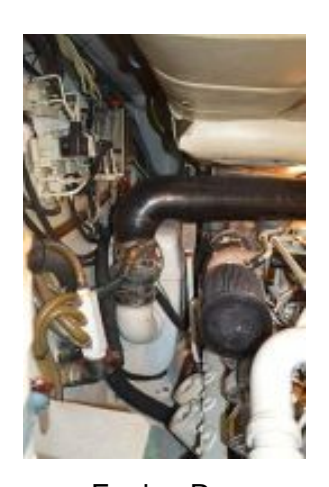
> Engine Room