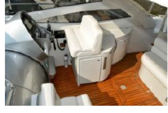
> View of helm from sunroof