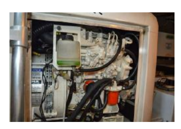
> Engine Room