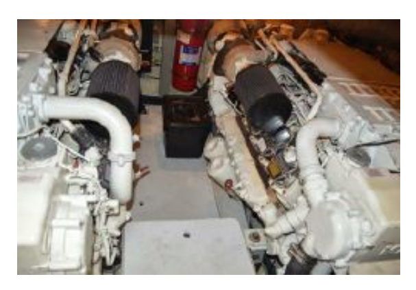
> Engine Room