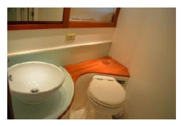
> Master Head