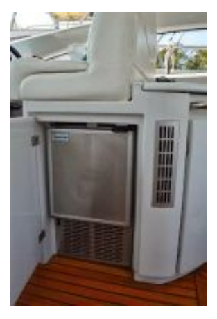
> Ice Maker