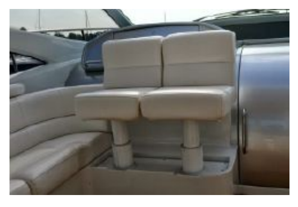
> Adjustable helm seating