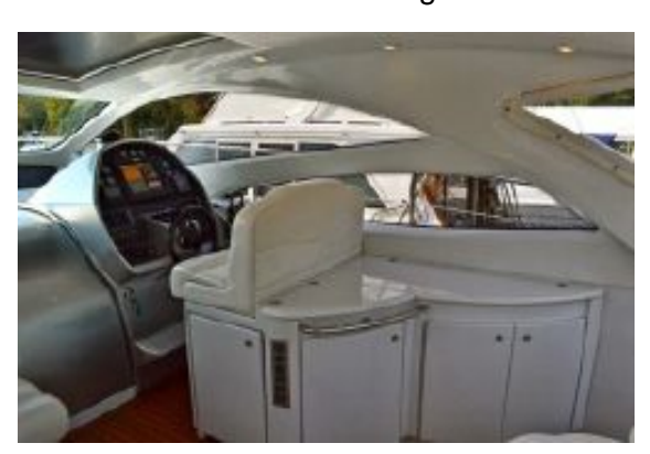
> Helm Area