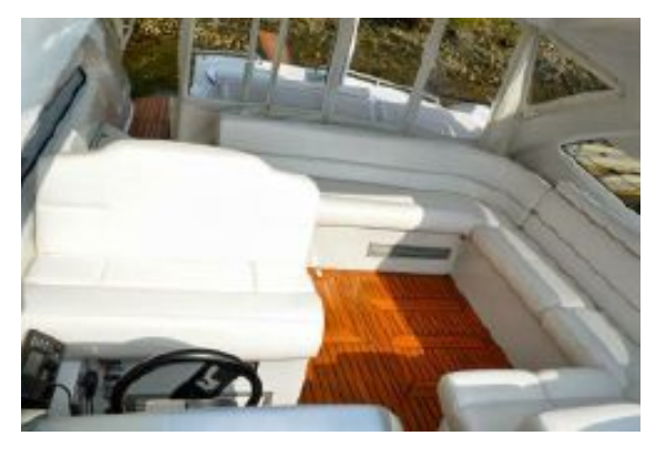
> Helm Seating