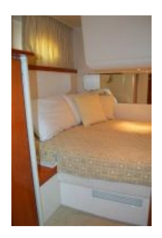
> Guest Stateroom