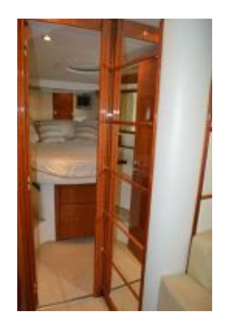
> Forward Master Stateroom