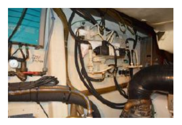
> Engine Room