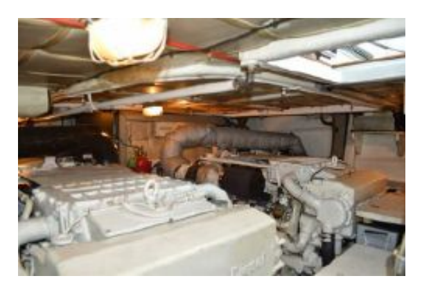
> Engine Room